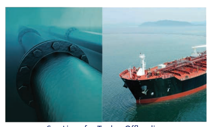
Sea Lines for Tanker Offloading