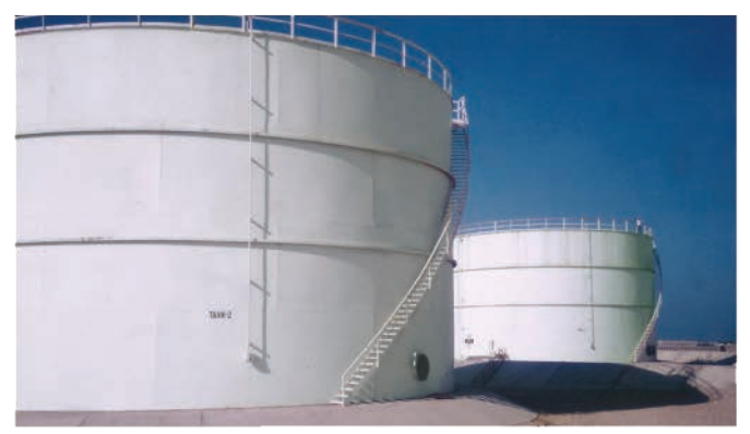
Fuel Terminals & Process Piping