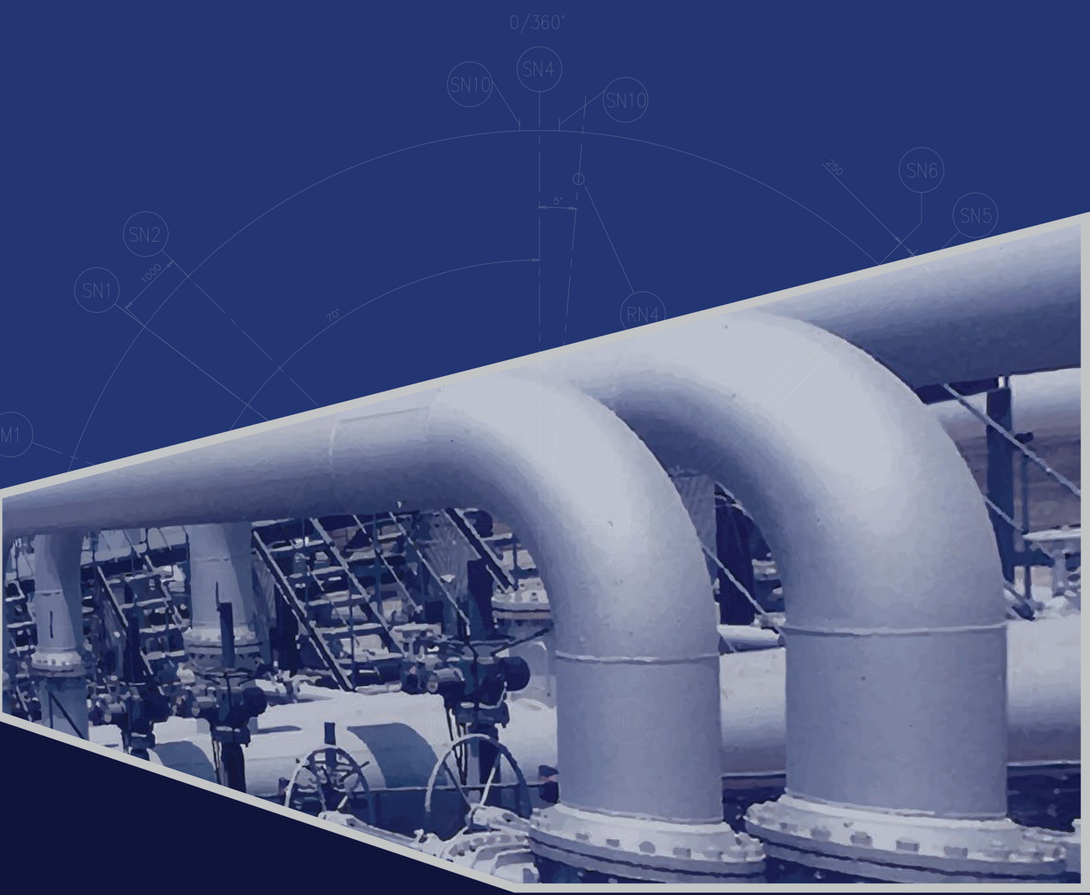
Precision. Engineering. Solutions.