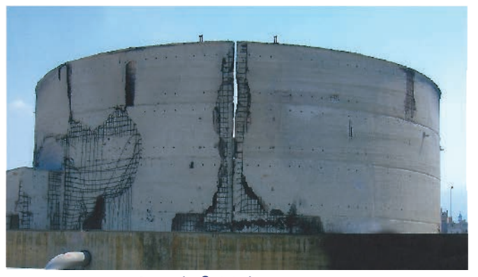
Repair & Maintenance